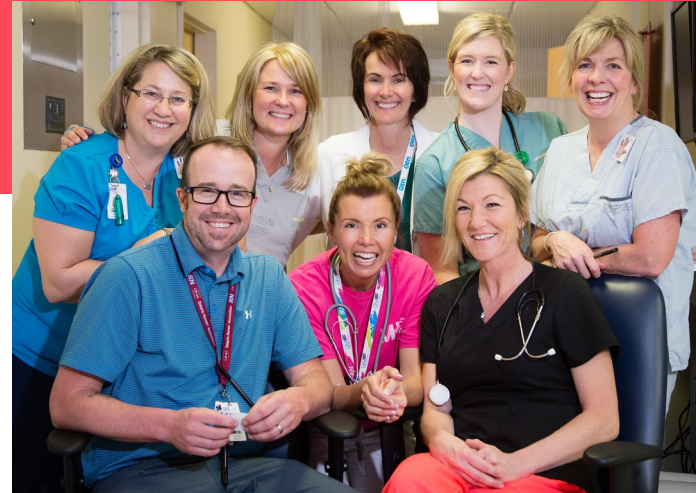
CPDMH staff who are ready to help you!

Many people in our community still do not know that the Ministry of Health and Long Term Care funds programs and services, but not patient care equipment. The reality is that we need well-functioning, reliable equipment that meets the current needs and high standards of care we aim to give our patients. Donor support means that we are able to provide this equipment to the many patients who walk through our doors each day.